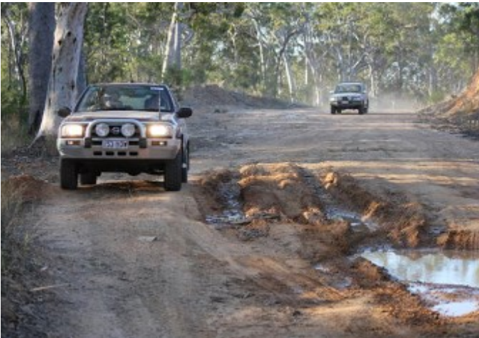
The convoy dodging some of the many bog holes and washouts along the Cooloola Way

I had my second recovery here when a young couple attempted to drive their Mitsubishi ASX (AWD) up off the beach and became stuck. After snatching them out I advised that they return to the hard sand on the beach and make their way back to the barge. We continued along the Freshwater Track (having afternoon tea at the day use area) until we reached the Rainbow Beach Rd.