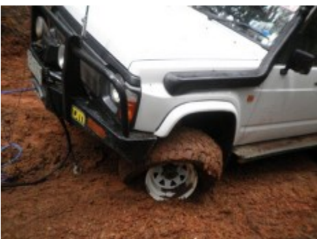
This was one of two tyres that popped a bead in the muddy conditions