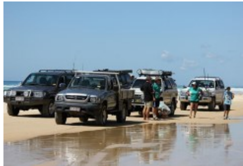
Our club members stop for a moment on the hard sand and take in the view

A short time later we stopped again towards the end of the beach camping area. This was our lunch stop with TJM having already set up BBQ's and their banner which an overzealous ranger tried to have removed. Basically we were left to our own devices until lunch was prepared.