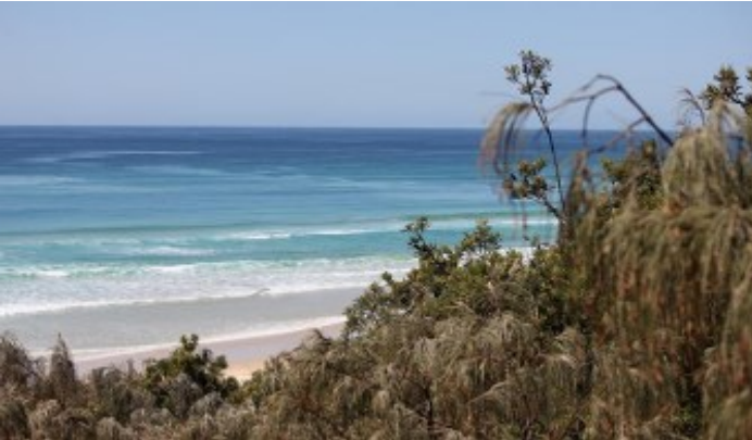
The Double Island Point area sure is beautiful !