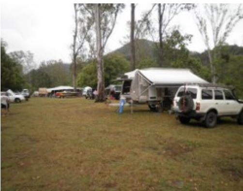
Campsite with the rain drizzling down