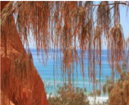
The vivid red and the shades of the ocean blue make for a truly beautiful backdrop

Just after crossing onto the beach we were all pulled over for an RBT. There was a strong police presence all along the beach making sure we didn't exceed the speed limit. It was a pleasant run up the beach with the ocean almost dead flat and a brilliant blue. A stop was made at Red Canyon to stretch our legs and check out the many different hues the dunes had on display. The view over the ocean was delightfully enhanced by its many shades of blue.