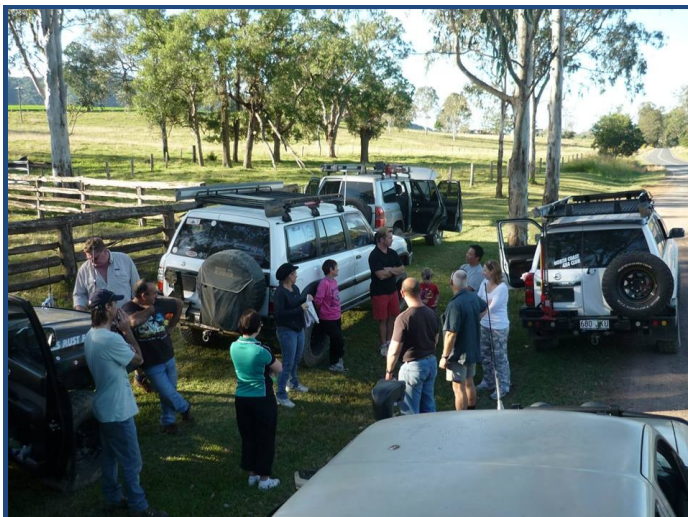
Airing up and discussing the awesome tracks we found for the Corroboree!

Congrats to the Bundaberg 4WD Club for having the most registrations so far. They have also nominated a team for the Lack of Talent Quest.....who's going to beat them???